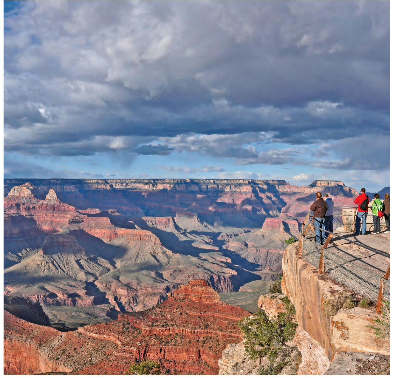
Grand Canyon NP Mather Point_0545