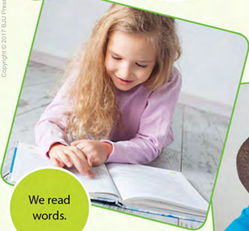
We read words.