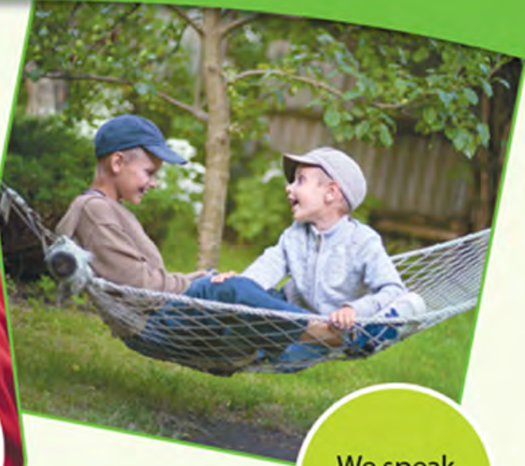
We speak words.