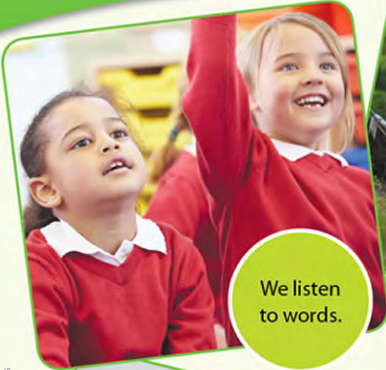
We listen to words.