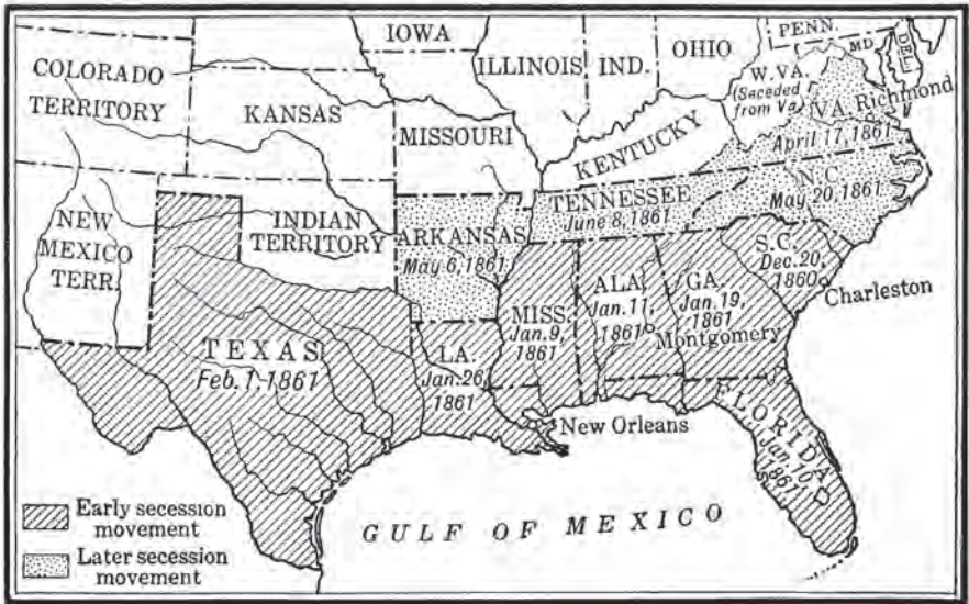
The Confederate States