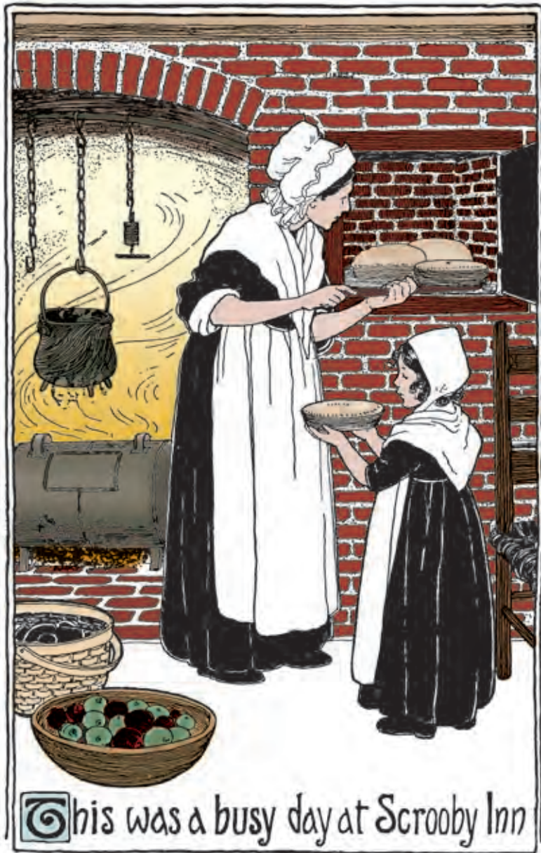
T his was a busy day at Scrooby Inn

Copyright © 2007 Christian Liberty Press