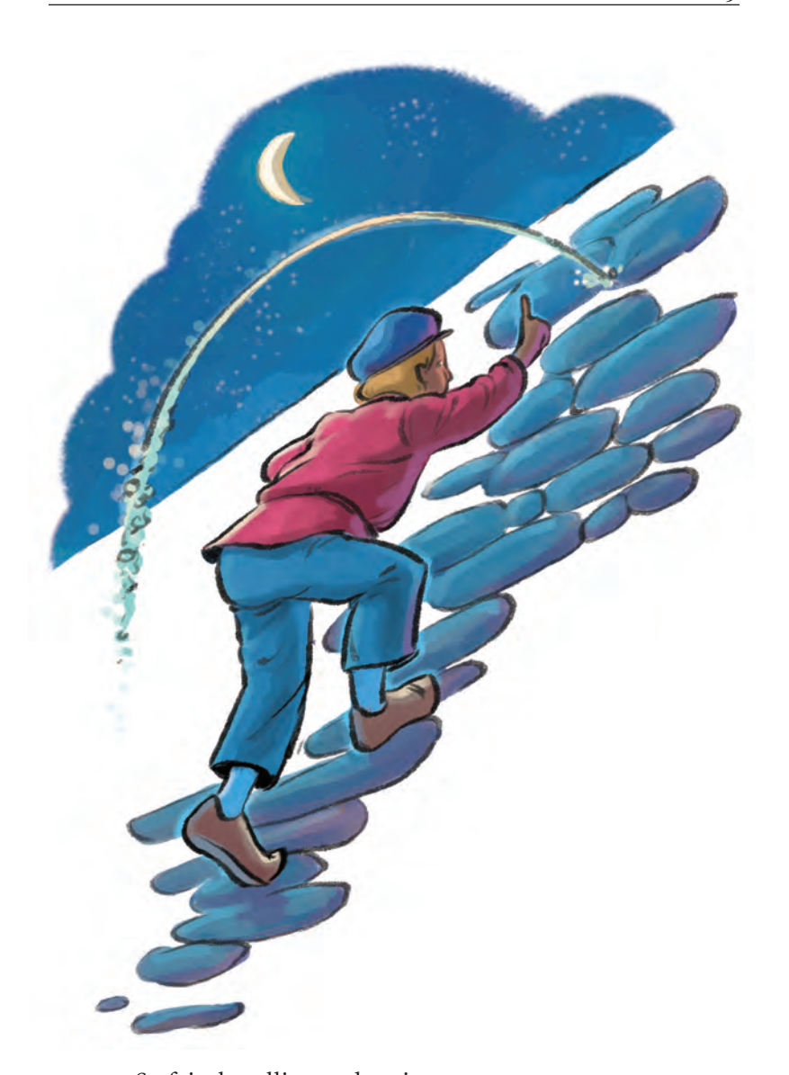
So faintly calling and crying Till the sun is under the sea; Crying and moaning till the stars Come out for company; He thinks of his brother and sister,